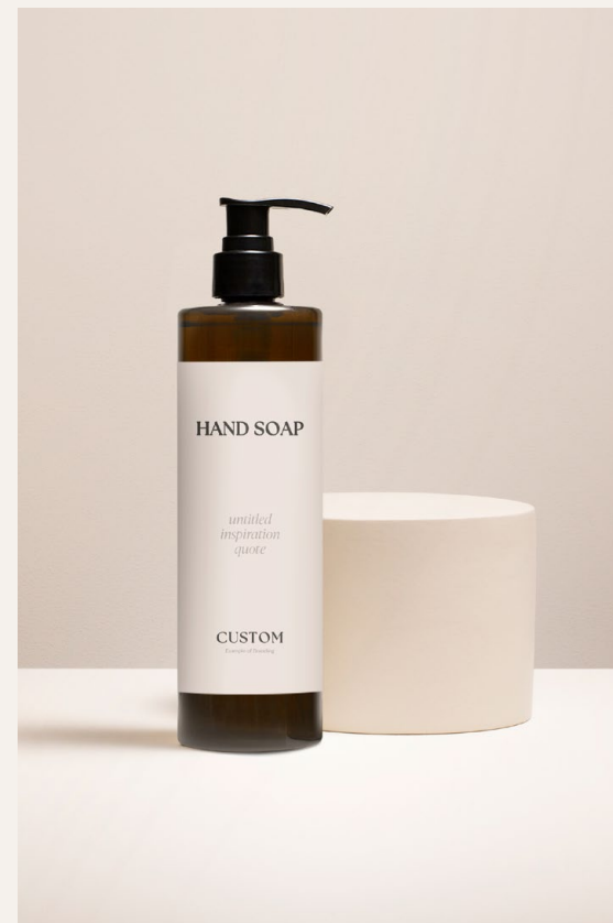
PRE-DESIGNED LABEL STYLE 2