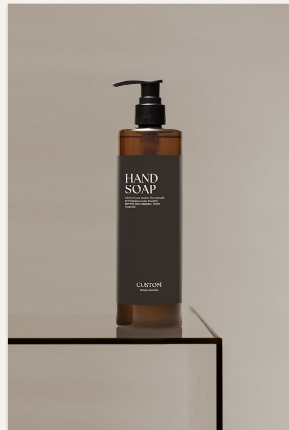
PRE-DESIGNED LABEL STYLE 1